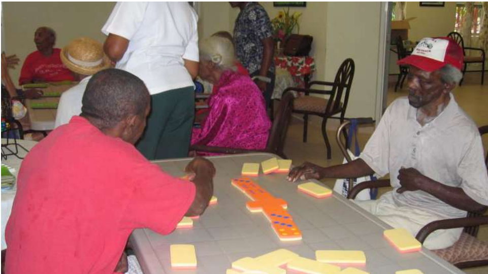
Elderly enjoying games

and health-related challenges that continue to affect the elderly and indigent. Through its work, the Circle has been implementing strategies that have enhanced the quality of life for the recipients.